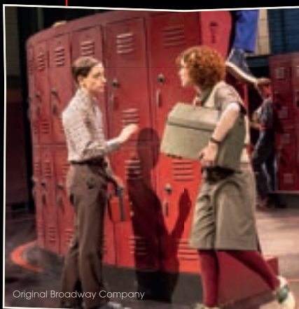
Original Broadway Company

Joyce also demonstrates a different form of courage: Her staging of Dark of the Moon is a rebellion against the restrictive confines of school under Principal Newby's leadership. Not only does she lie about staging Oklahoma! , she dares to stage a play about witchcraft in this conservative and Christian town. She is also fiercely independent, determined to obtain a scholarship, which would mean leaving Hawkins and her boyfriend.