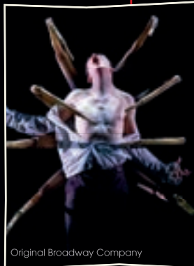
Original Broadway Company

The plot of Stranger Things: The First Shadow challenges us to consider whether some people are born “bad,” or whether it is entirely external forces which make them that way. Henry’s reactions when he hears of the consequences of some of his actions demonstrate that he does have moral awareness but is fighting an inner battle between good and evil forces. Some of the adults in the story behave poorly, perhaps because of their own experiences (such as experiences during World War II), but also perhaps because they are, by nature, malevolent and self-serving. Several characters make significant sacrifices to help others, but would everybody (including ourselves) have behaved in the same selfless way?