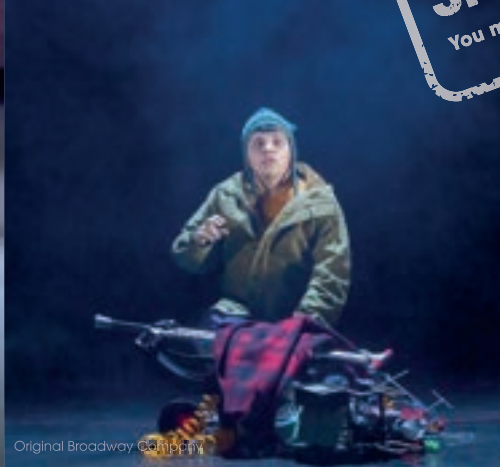
Original Broadway Company