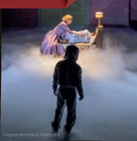
Original Broadway Company

This synopsis contains plot spoilers SPOILER ALERT! You may wish to revisit these pages after you have seen the production.