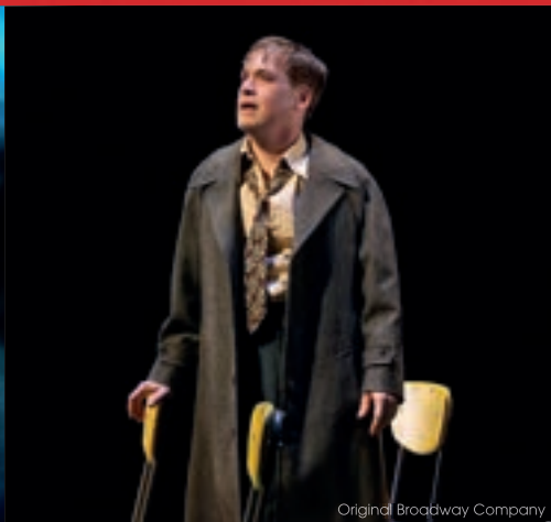
Original Broadway Company