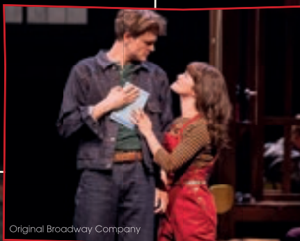
Original Broadway Company

The young people in Hawkins have to take matters into their own hands to investigate the mysterious events that the adults refuse to acknowledge. The teenagers are often wiser and more insightful than the adults who are in charge. They also call out injustices as they see them, including Patty's self-defence against Newby's criticisms, Hopper Jr.'s treatment at the hands of his father, and Joyce's demands for greater artistic freedom. They must also deal with a range of emotions, including grief, anger, fear and love.