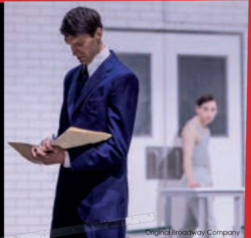
Original Broadway Company

Images of Henry's 11th birthday party flash on the screen. He has been given a Captain Midnight kit as a present, with the motto "justice through strength and courage."