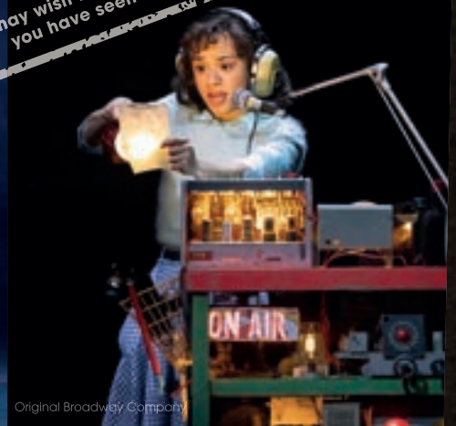
Original Broadway Company

It is October 28th, 1943. The USS Eldridge is part of a secret experiment known as Project Rainbow. The ship loses power, radios screech, and something mysterious is in the water. Suddenly, the ship disappears and is seen again in the Abyss, another dimension.